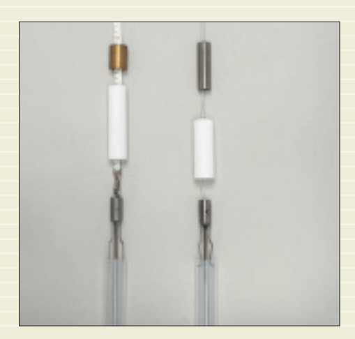
Sample tubes with messenger

As glass plunging siphons tend to break easily the unbreakable translucent teflon is applied. The inert