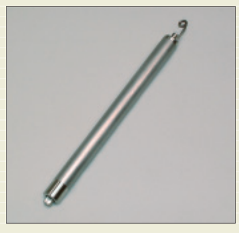
Tank bottom sampler