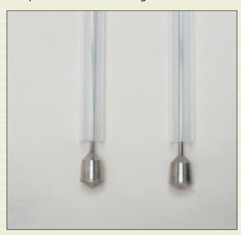
Sample tubes with bottom stop

teflon is not affected by chemicals avoiding the sample to be contaminated by the equipment. The plunging siphon is heat resistant to a temperature of 250°C.