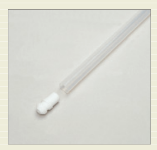
Plunging siphon with narrowing cone

The sampler has a length of 39 cm and a diameter of 28 mm, contents 110 ml.