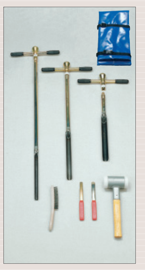
Set for stepwise sampling

This bi-partite gouge auger distinguishes itself from other gouges by the cylindrical tapered cutting head at the bottom side of the gouge that, when the auger is pushed into the soil, cuts a cylinder shaped piece from the soil. As a result the auger does not need to be revolved around its axis after being inserted, as the other gouge augers