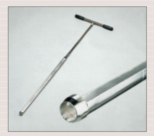
Gouge auger model P

For this auger roughly the same applications apply as for the ordinary steel gouge augers. This type of auger is particularly suitable for soil mapping because of its small diameter and the cylindrical cutting head.