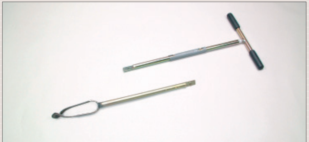
Bi-partite Edelman auger

The 01.09.SB set with dividable piston sampler enables you to take samples of various lengths with sample tubes with 50, 100 and 150 cm length. This sampler is easier to clean and the samples can be transported in the tubes.