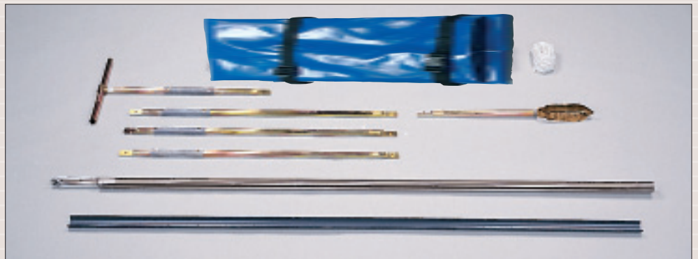
01.09.SA Piston sampler set