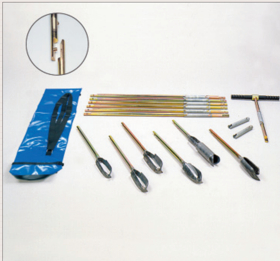
Prospecting kit for geological surveys with bayonet connection

The geological prospecting kit weighs only 16.5 kg and allows quick tracking in the bush.