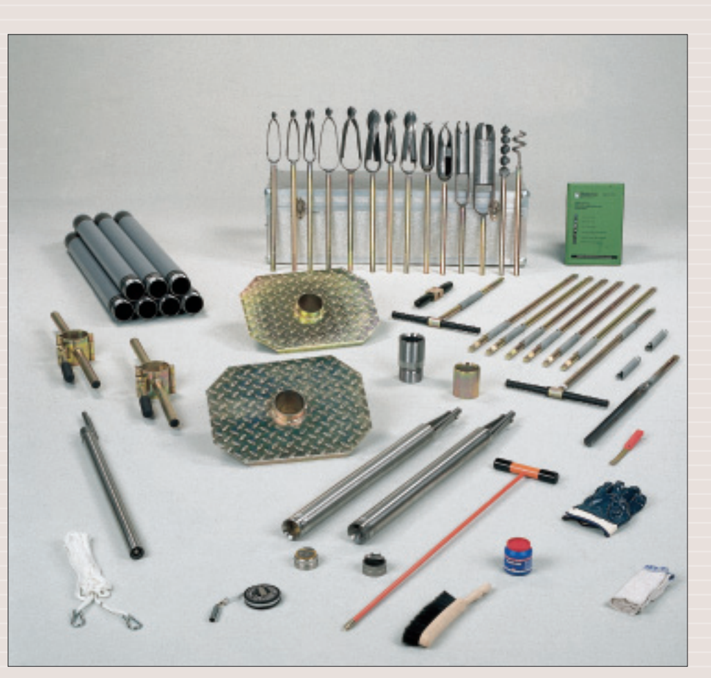
Hand-operated bailer boring auger set

The bailer, an essential part of the set, is a stainless steel tube with a stainless steel or synthetic valve on the lower part. By moving the bailer rapidly up and down loose material will collect in the bailer.