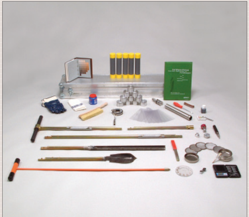
Soil sampling and classification set