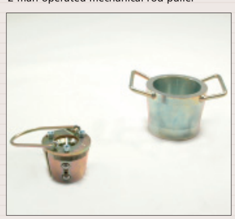
Casing/rod puller clamp + clamping jaw