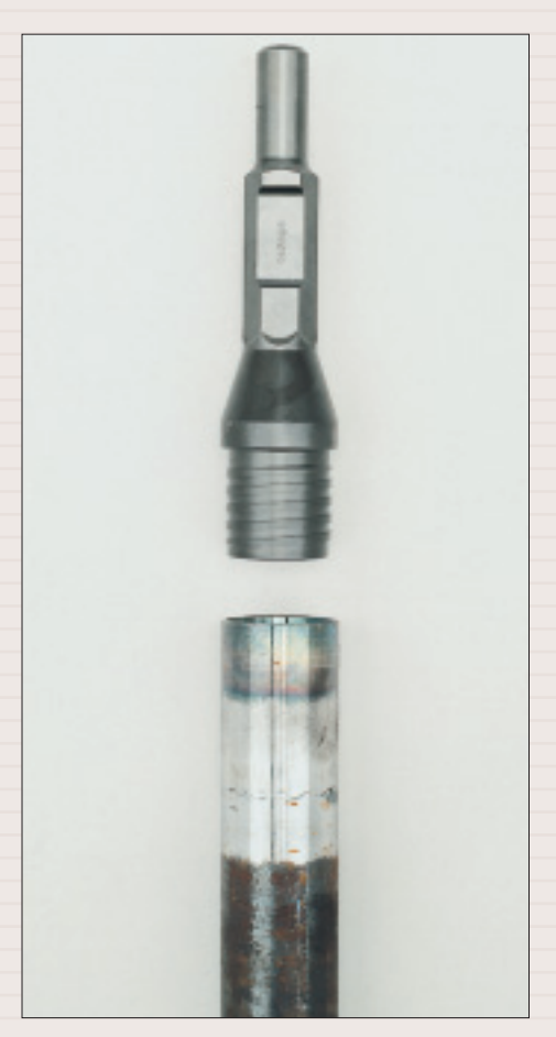
Casing with striking pen