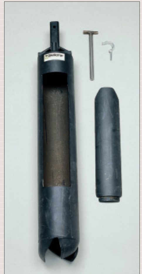
Heavy Riverside auger with side flap