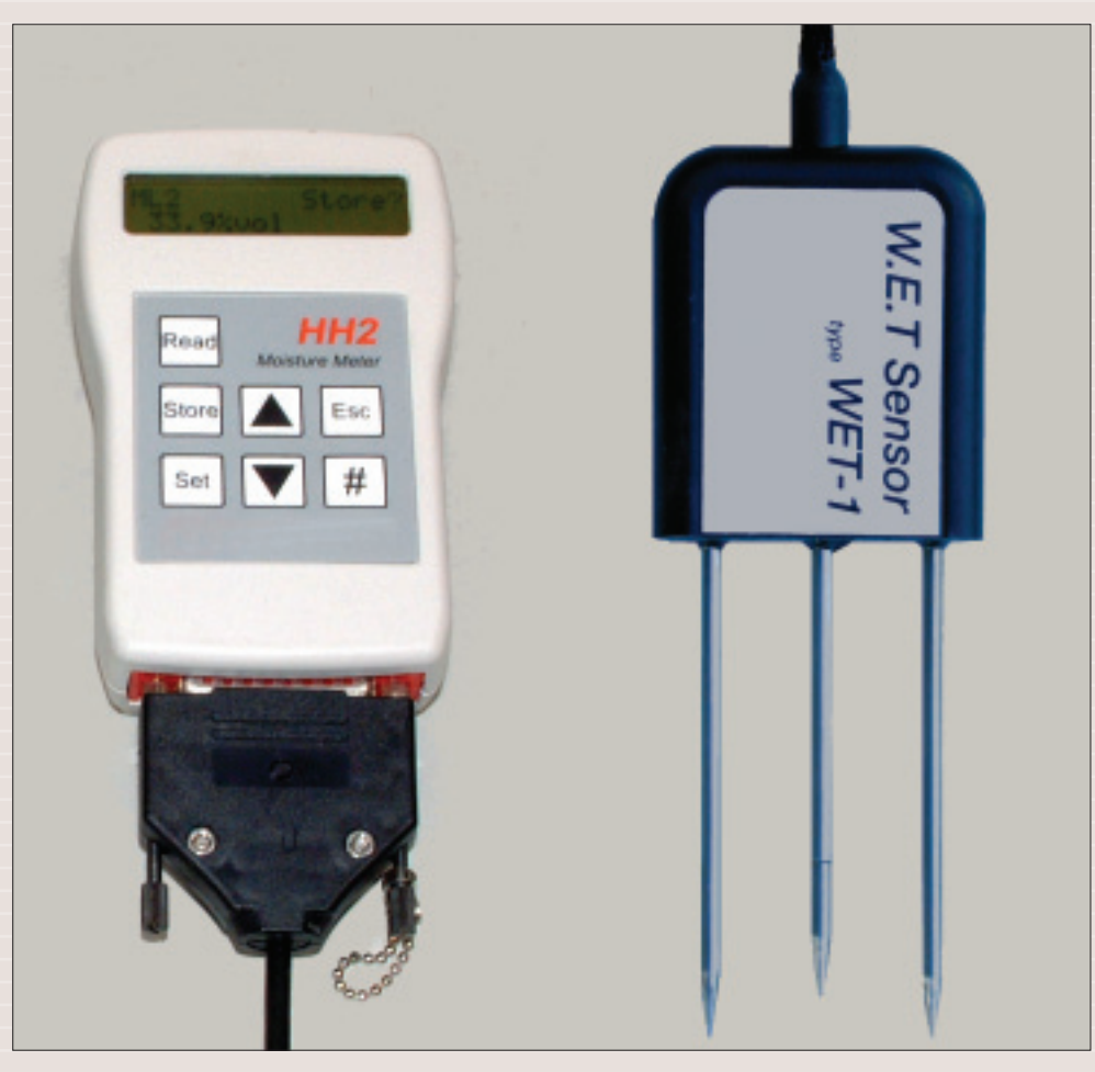
W.E.T Sensor and hand meter