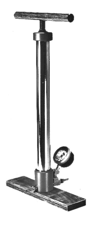
Pressure-Vacuum Hand Pump Model# 2006G2

The Pressure-Vacuum Pump (Model No. 2006G2) is a simple, versatile supply source of pressure or vacuum for rugged field or laboratory use. Whether you are extracting solution samples for analysis or pressurizing extractors in the field, the Pressure-Vacuum Hand Pump will move 1/2 liter of air with each pump stroke.