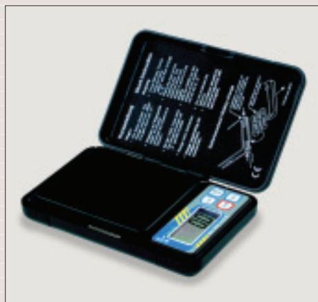
Portable field balance