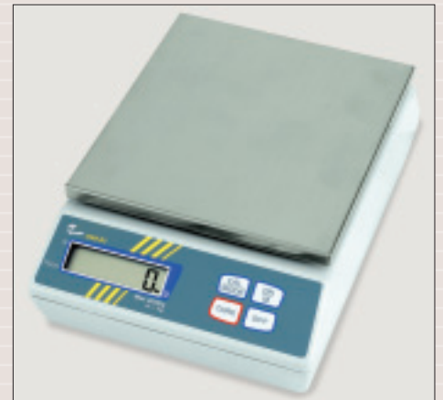
Electronic balance capacity 4000 g