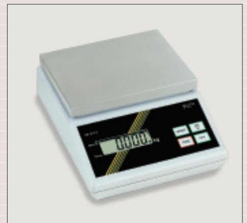
Electronic balance capacity 12000 g