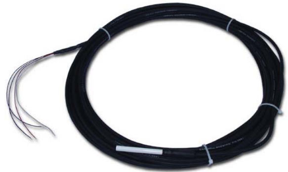
Each 107 or 108 probe requires one single-ended channel for measurement.

To attach the 41303-5A to a CM202, CM204, or CM206 crossarm, place the 41303-5A's U-bolt in the bottom holes.