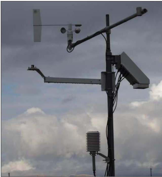
The CS110's internal datalogger can measure additional meteorological sensors—making the CS110 the center of a full weather station.