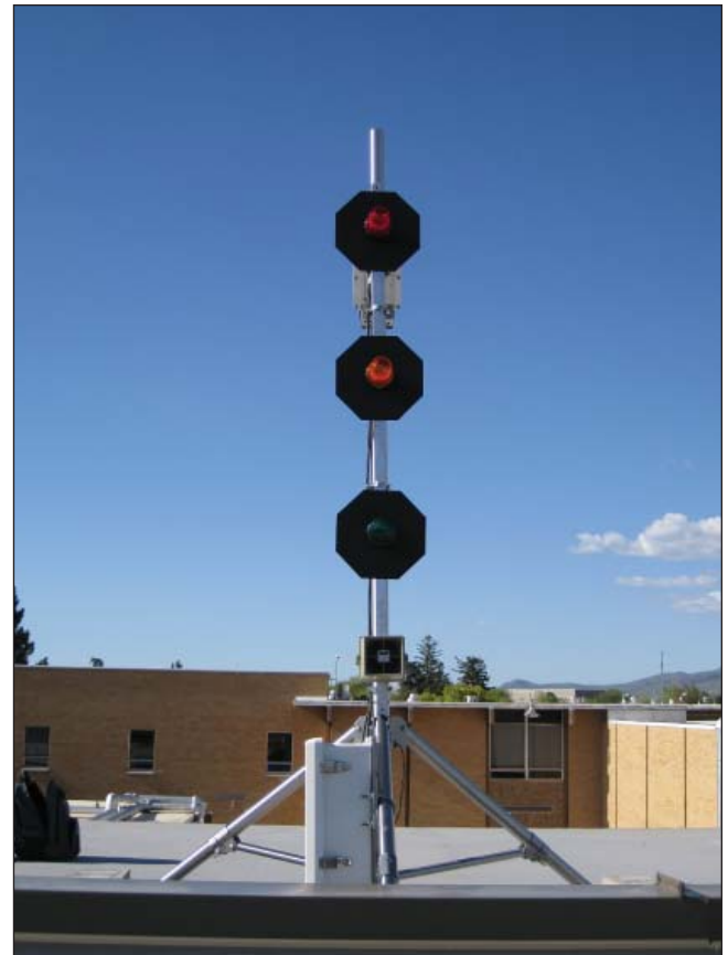
Logan High School in Logan Utah has installed a lightning warning system that includes the CS110. The CS110 is mounted to a CM110 10-ft stainless-steel tripod that sits on a roof next to the football field (left). Lights included in the system indicate the likelihood of lightning (right).