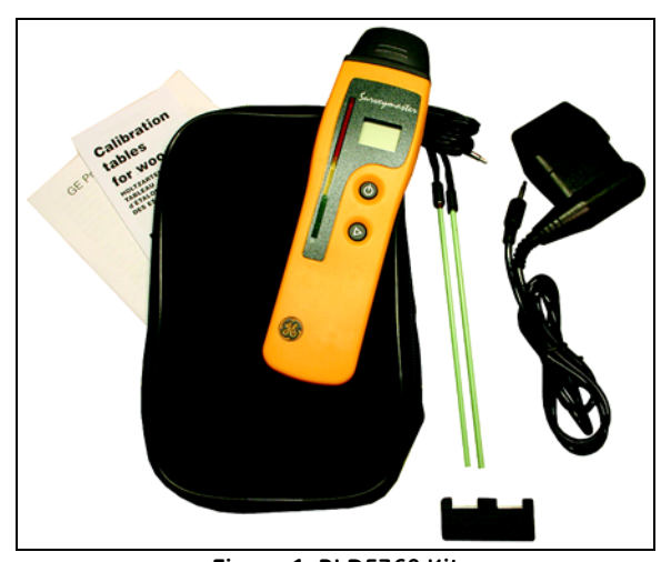
Figure 1: BLD5360 Kit