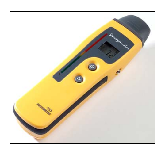
Surveymaster<sup>®</sup> Protimeter Dual-Function Moisture Meter