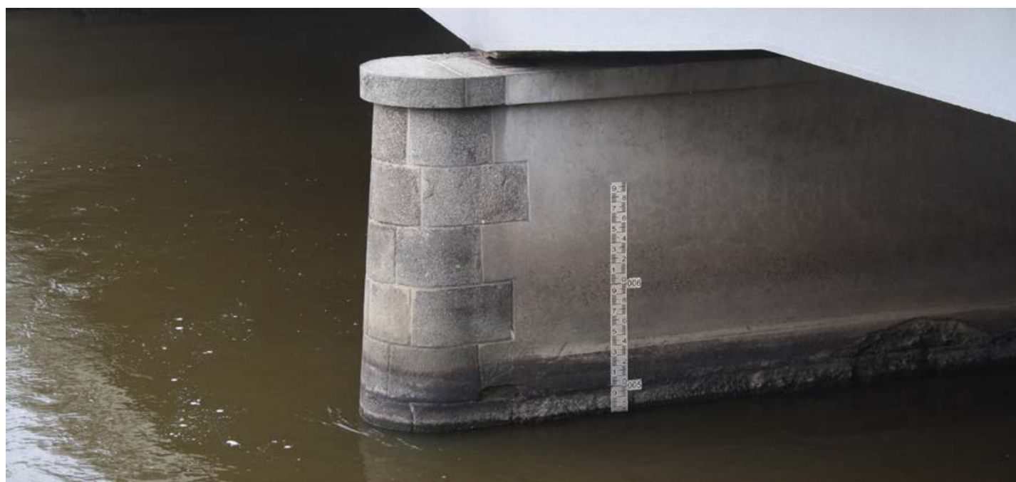
Staff gauges installed on bridge pillar

It is a centering devices that ensures easy and consistent measurements .