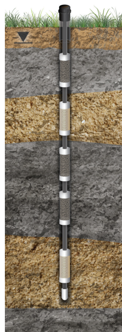
Typical 3-Channel CMT Installation in Overburden with Bentonite and Sand Cartridges

Saves Cost – through reduced permitting and drilling costs; and because narrow tubes allow smaller purge volumes, reduced disposal costs, efficient low flow sampling and rapid response to pressure changes, all reduce field time.