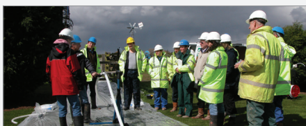
CMT Installation and training as part of a “Multilevel Course” given by the University of Cranfield at Silsoe, U.K., in conjunction with Waterra (UK), British Geological Survey & Norwest Holst.

Please contact Solinst should you wish to attend or set up a training session.