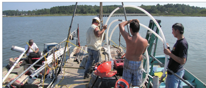
CMT Systems were installed at the bottom of a bay to measure submarine groundwater discharge. Eight 7-Channel CMT Systems were installed, with custom modifications to suit the open water application. Watertight wellheads had to be custom built to allow for sampling from the surface of the bay using a peristaltic pump.