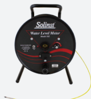
Model 102 Water Level Meter

Vapor Samples: A special Vapor Wellhead Assembly can be used to obtain depth discrete vapor samples.