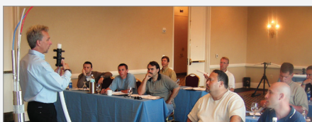
Instructing drilling contractors and consultants on CMT installation techniques at Battelle Bio-Symposium, Baltimore, Maryland.