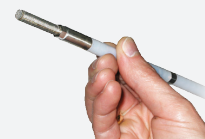
Model 408M DVP 3/8" (9.5 mm)