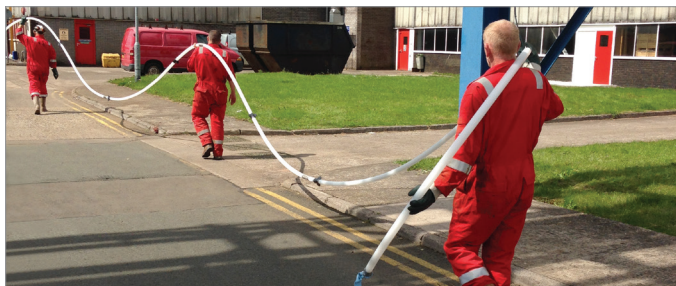
Nineteen 7-Channel CMT Systems were installed inside a manufacturing facility to characterize and monitor a plume beneath the building that is migrating off site. Systems were installed using sonic drilling to 30 m (100 ft) depths. Challenging geology made drilling and installation tricky, however, all Systems were installed in two weeks.