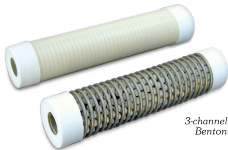
3-channel CMT Sand and Bentonite Cartridges

These cartridges are approximately 2.4" (61 mm) in diameter and will fit inside various direct push drill rods. Ideally, the borehole diameter these bentonite cartridges are used in should not exceed a nominal 3.5" (90 mm), to ensure proper expansion and sealing.