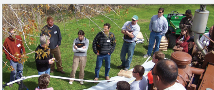
Outdoor installation/ demonstration at premises of Parrat-Wolff, Environmental and Geotechnical Drilling Services, Syracuse, New York.