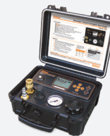
Model 464 Electronic Control Unit