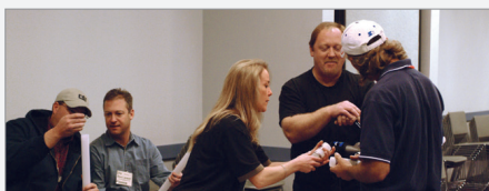
The first CMT contractor training course, conducted at the NGWA Expo in Las Vegas, December 2004. Contractors are being instructed on proper port construction.