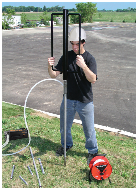
Installing Piezometers with a Manual Slide Hammer

Solinst Drive-Point Piezometers can be driven into the ground with any direct push or drilling technology, including the Manual Slide Hammer shown at right. To avoid clogging or smearing of the screen during installation, a shielded version is also available.