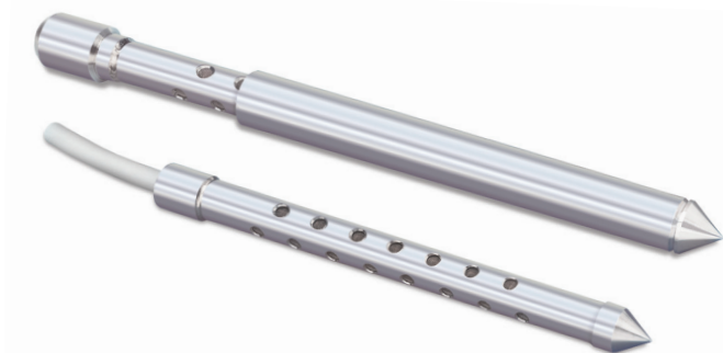
Model 615 Drive-Point and Shielded Drive-Point Piezometer