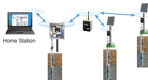
STS Edge Remote Station

You can expand your telemetry system by connecting a Solinst RRL network to a STS Edge Remote Station. A closed-loop network of RRL radios reports data to the STS Edge; all data is then sent to the Home Station via the STS Edge GSM modem. Up to four dataloggers can be connected to each RRL. (See Model 9200 Data Sheet.)